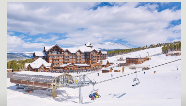
ONE SKI HILL PLACE