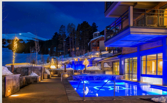
GRAND COLORADO ON PEAK 8