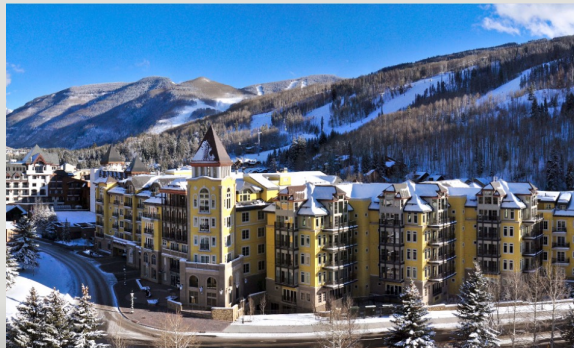
THE RITZ-CARLTON RESIDENCES