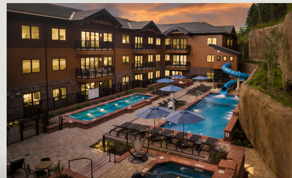
FRONTGATE | AVON